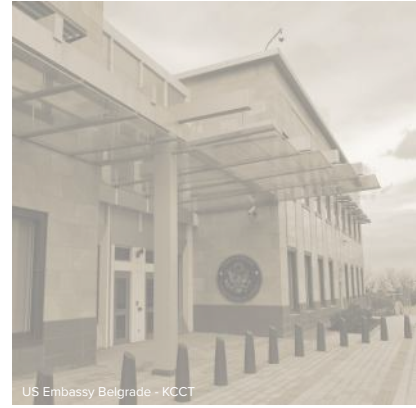
US Embassy Belgrade - KCCT