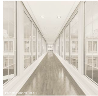
Potomac Annex - KCCT