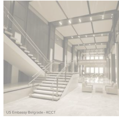
US Embassy Belgrade - KCCT