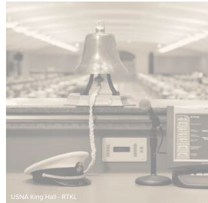
USNA King Hall - RTKL