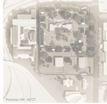
Potomac Hill - KCCT

WBC Craftmanship Star Award - USNA King Hall